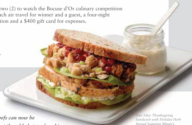
Day After Thanksgiving Sandwich with Holiday Herb Spread featuring Minor's Turkey Base and Herb de Provence Flavor Concentrate

Three runners-up will receive a professionally styled and photographed canvas print of their submitted recipe.